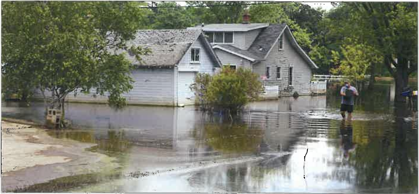
Janesville, Wisconsin, 2008