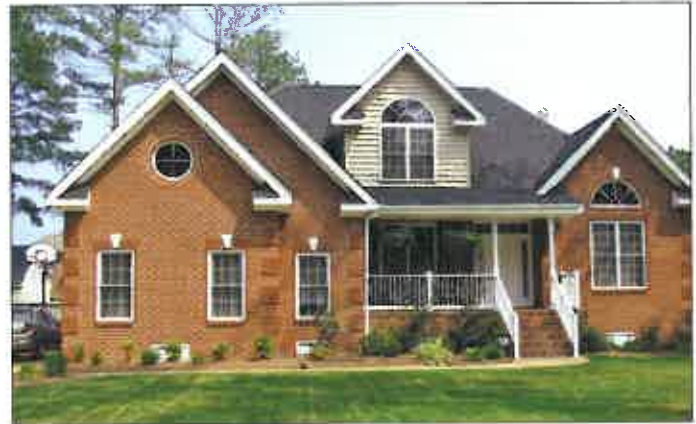
Elevated home on crawl space foundation

make conventional loans for insurable buildings in flood hazard areas of non-participating communities. However, the lender must notify applicants that the property is in a flood hazard area and that the property is not eligible for Federal disaster assistance. Some lenders may voluntarily choose not to make these loans.