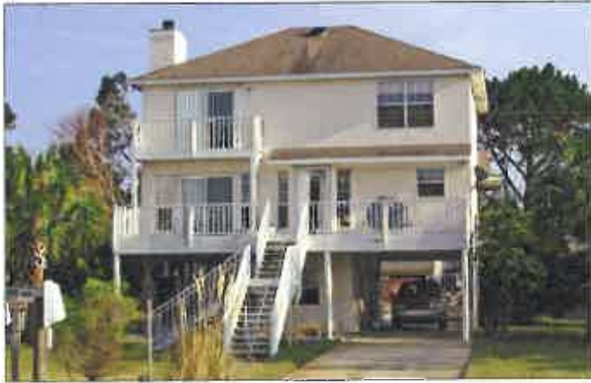
Elevated home on pile foundation