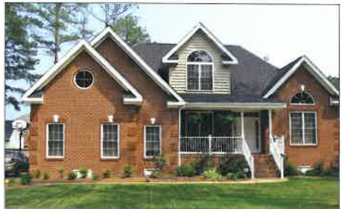
Elevated home on crawl space foundation

make conventional loans for insurable buildings in flood hazard areas of non-participating communities. However, the lender must notify applicants that the property is in a flood hazard area and that the property is not eligible for Federal disaster assistance. Some lenders may voluntarily choose not to make these loans.