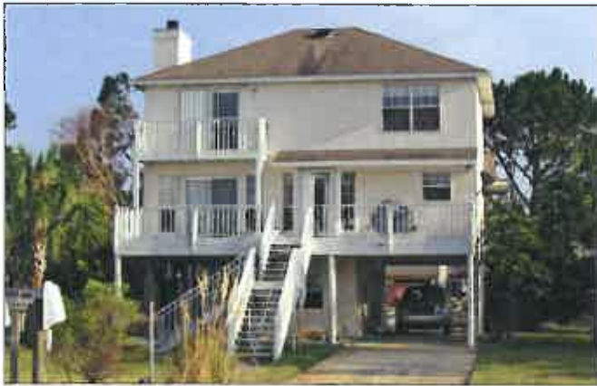
Elevated home on pile foundation