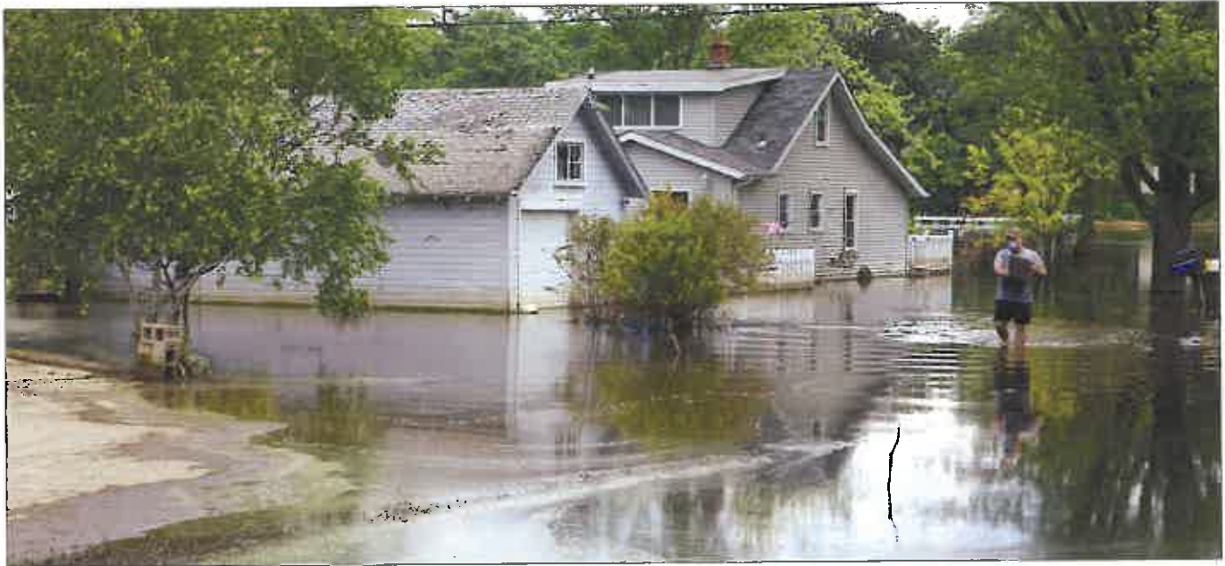
Janesville, Wisconsin, 2008