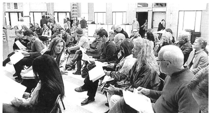
Scores of residents turn out this week at a town hall meeting to voice concerns over rehab facilities in their neighborhoods.

Both the owner and director of Pillars Recovery, which opened at 28772 Top of the World Dr. last year in close proximity to the campus, addressed the crowd of about 150 people and defended the facility's practices.